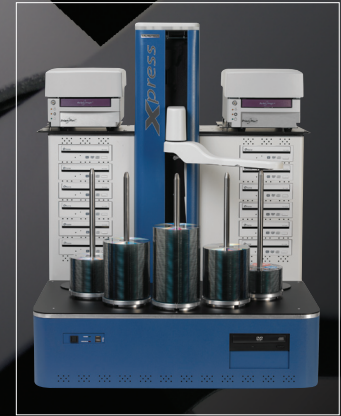
High Capacity Mixed Media CD/DVD Production Microtech's Xpress XL